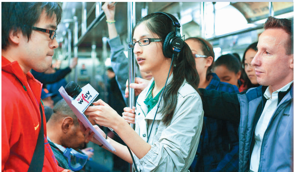
NEW YORK CITY STUDENTS DO INTERVIEWS ON THE SUBWAY FOR THEIR NEWS LITERACY PROJECT FIELD WORK