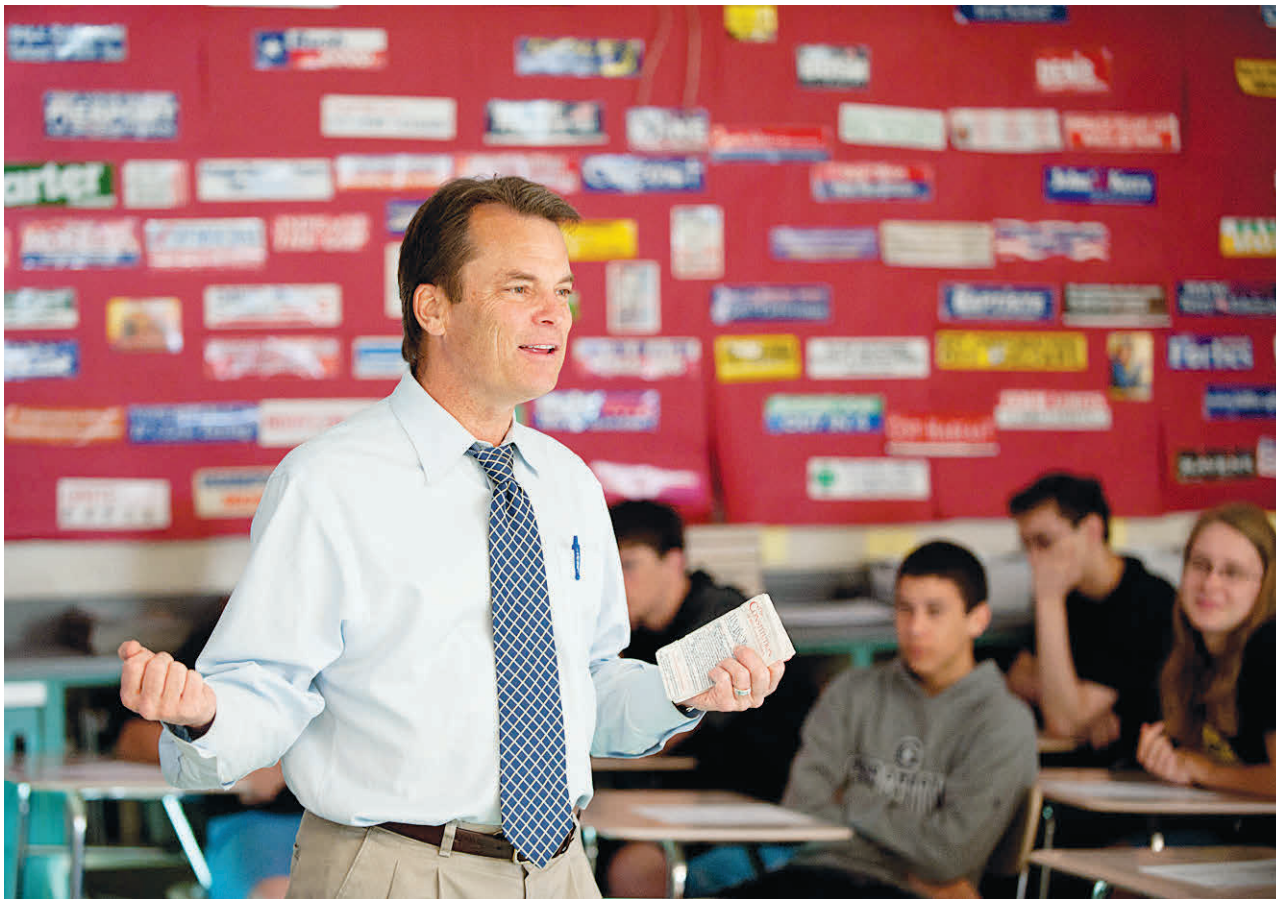
CBS NEWS CORRESPONDENT CHIP REID WITH BETHESDA HIGH-SCHOOL STUDENTS